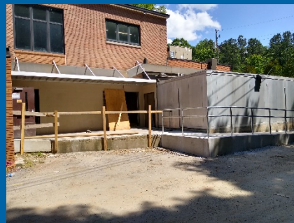
Hang Canopy at Loading Dock and Install Handrails at Ramp