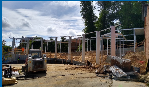
Continue Install of Canopy at ADA Ramp