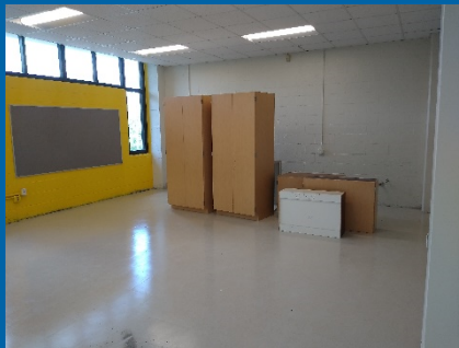
Begin Install Casework at Building 2010