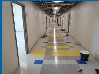
Continue Install of VCT at Building 2010