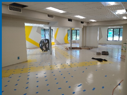
Lay VCT and Apply Finish Coat of Paint in Cafeteria