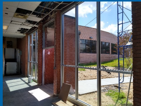
Complete Install of Storefront System and Glass at Connector